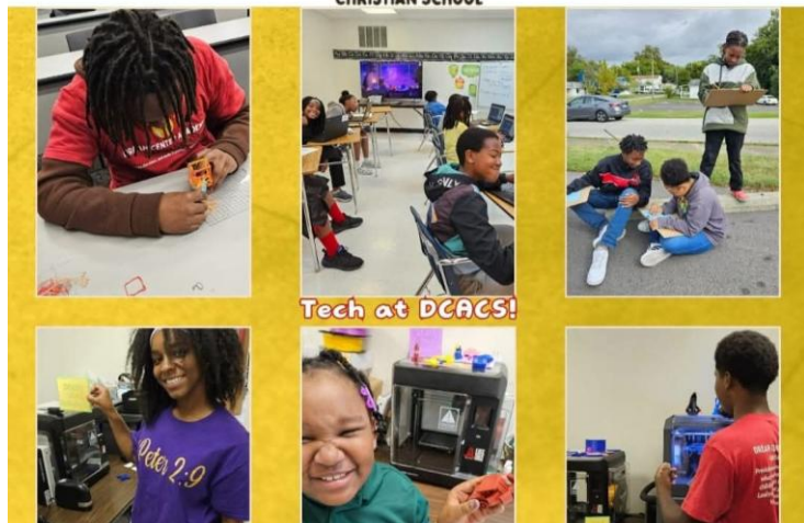
Tech at DCACS!