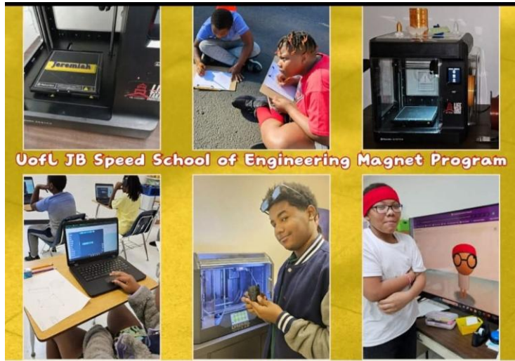
UofL JB Speed School of Engineering Magnet Program